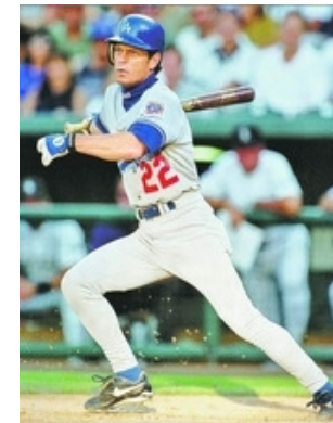
LA Dodgers #22 Brett Butler

In the middle of the 1996 baseball season Brett Butler was diagnosed with throat cancer. It was said that it would end his career. But Butler predicted he would be back before the season ended. Bravely, he endured the radiation, chemo and physical therapy, and as predicted, he rejoined the Los Angeles Dodgers just in time for the playoffs.