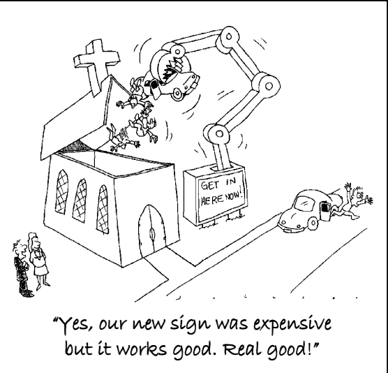
“Yes, our new sign was expensive but it works good. Real good!”

Sandy Valley Baptist Church 1124 S. Houston Lake Rd. Warner, GA 31088 Vol. 9 No. 12 April 8, 2008 Return Service Requested